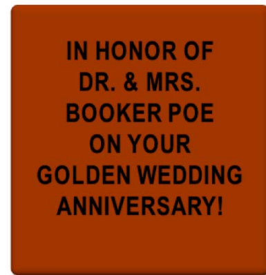
(8" x 8" Sample)

Inscription may be up to six lines of text, up to 16 characters per line including spaces